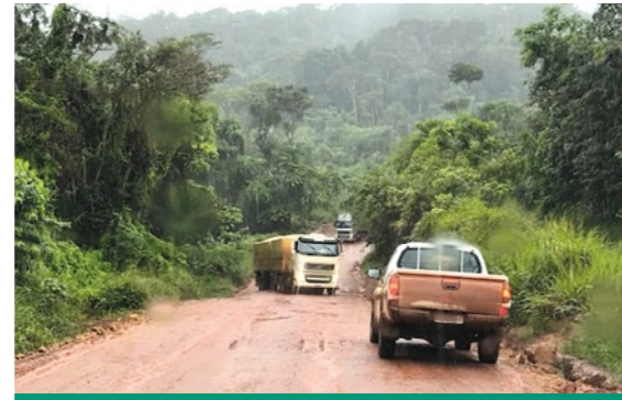
On the road to Itaituba