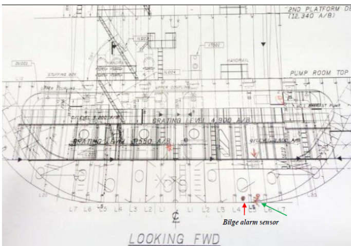
Ref TM Report 03/2021 - Location where the fatally injured pump man was found (green arrow)

The autopsy identified that the pumpman struck his head and it is possible that this happened as the pumpman was trying to exit the bilge space. Whilst not proven, there is a theory that the pumpman may have sensed the presence of H 2 S and, that as a consequence, he may have been trying to make his way out of the bilge space. There was also a small quantity of oily water in the starboard bilge space and it is thought that this may have caused the pumpman to slip and strike his head, rendering him unconscious and further exposing him to the toxic gases.