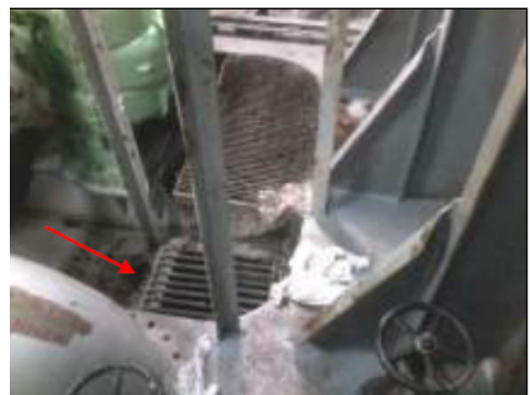
Ref TM Report 03/2021 - Access manhole for stb'd side bilge sensor (Red arrow)

Enclosed and restricted space recovery procedures , as was experienced in this instance, access to some locations on a vessel, particularly in areas such as pumprooms and bilge spaces, may be restricted due to the layout and structure of the vessel. Emergency exercise and drills should be utilised to identify potential problem areas and risk assessments and contingency measures should be identified, implemented and exercised against. Whilst not highlighted in the investigation report, the availability of an Emergency Escape Breathing Device (EEBD) may have been beneficial. Had the pumpman detected gas and donned an EEBD he may have been able to leave the bilge spaces in a controlled fashion. The provision and carriage of EEBD's being one of the corrective actions implemented post incident.